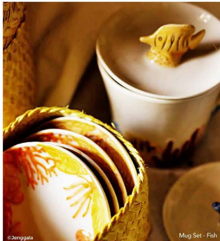
Mug Set - Fish