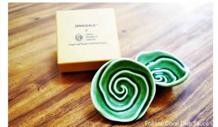
Foliose Coral Dish Sauce