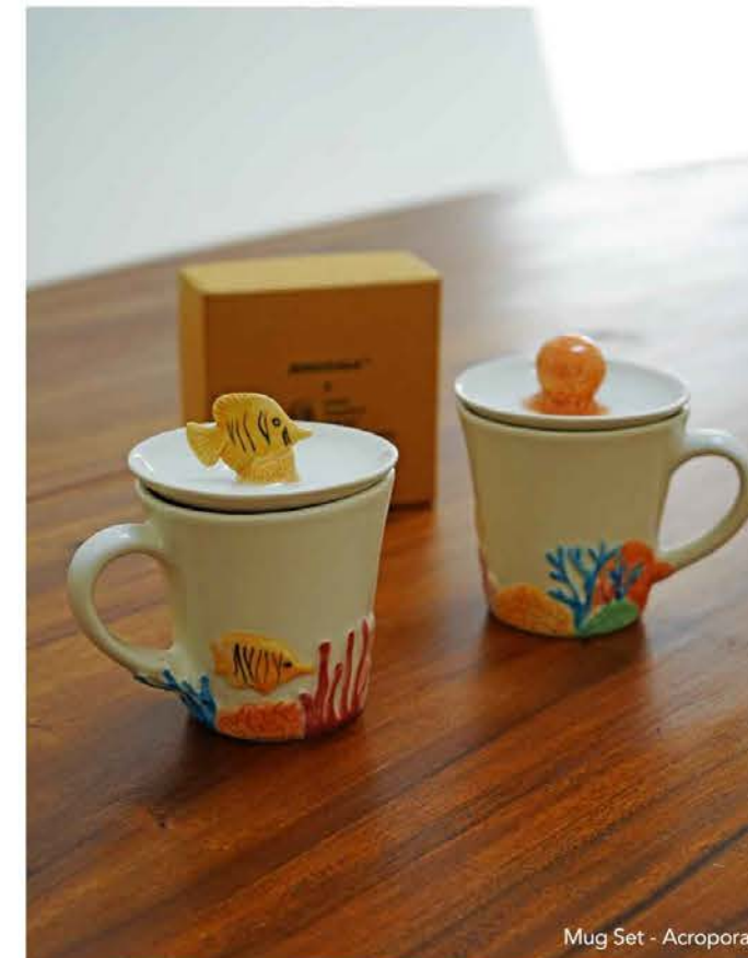
Mug Set - Acropora