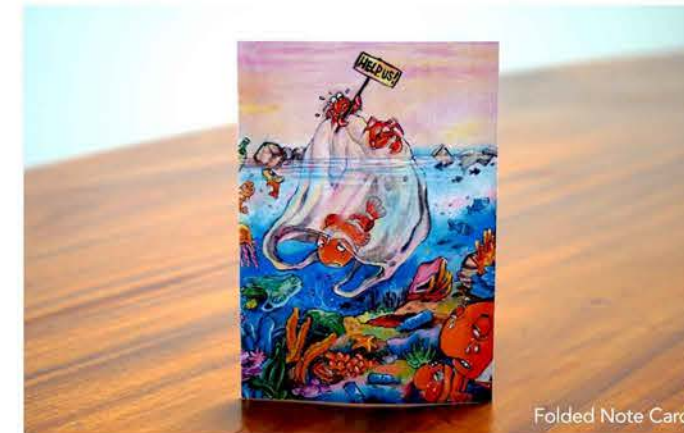
Folded Note Card

CTC celebrated Coral Triangle Day on June 9, 2020 through an online art and storytelling competition called "Art for the Oceans". A total of 90 children from all over Indonesia joined the activity, highlighting the theme "Working Together Towards Plastic-Free Coral Triangle," inspiring each other to protect the ocean that connect us all. There were 10 winners selected for their artistry and creativity in interpreting the theme.