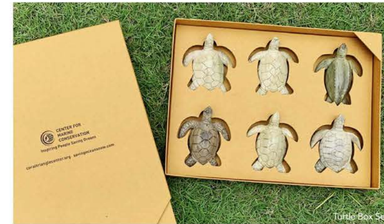
Turtle Box Set