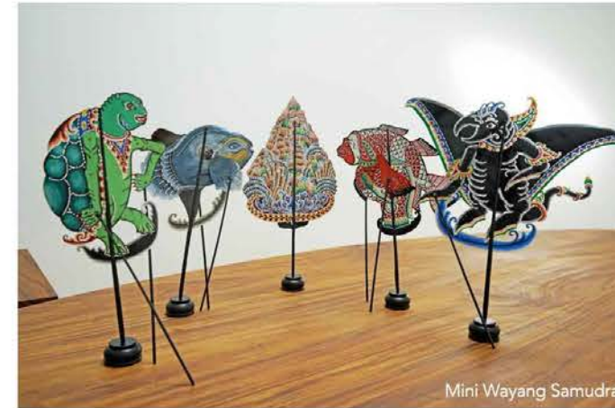
Mini Wayang Samudra