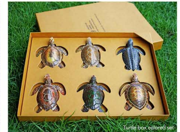
Turtle box colored set