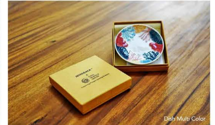
Dish Multi Color