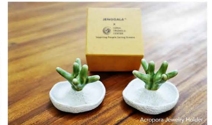
Acropora Jewelry Holder