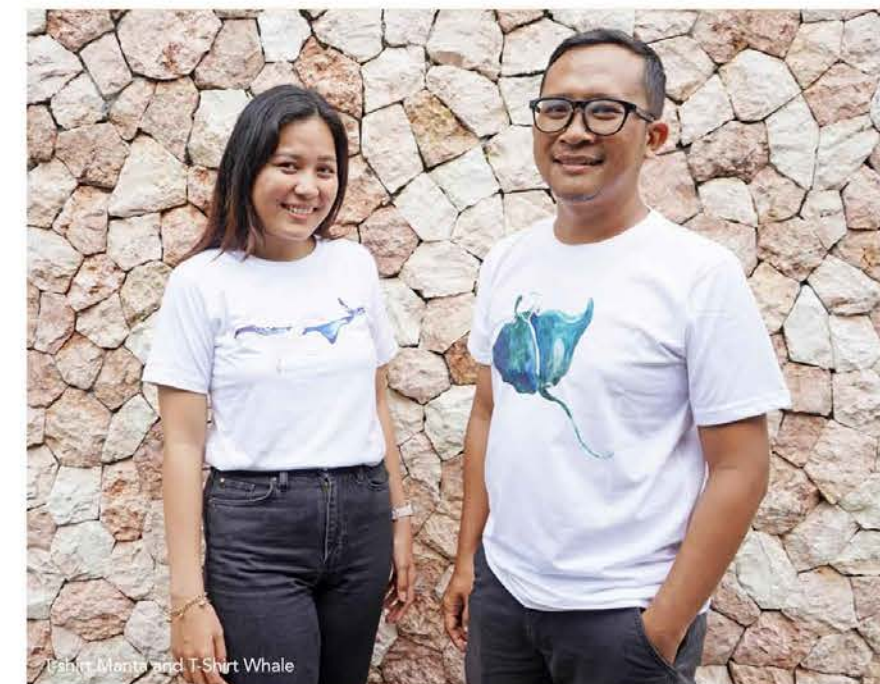
T-shirt Manta and T-Shirt Whale