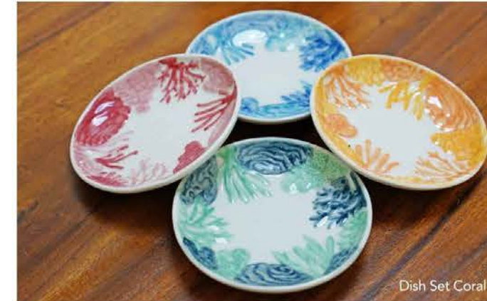
Dish Set Coral