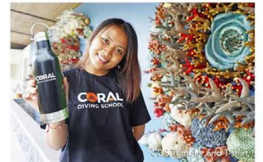
CDS Tumbler and T-shirt