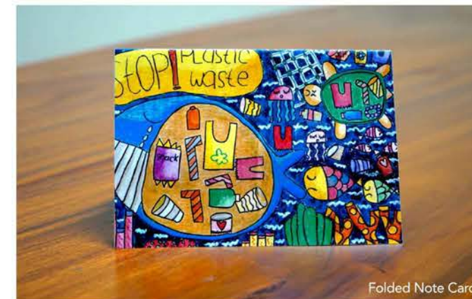
Folded Note Card