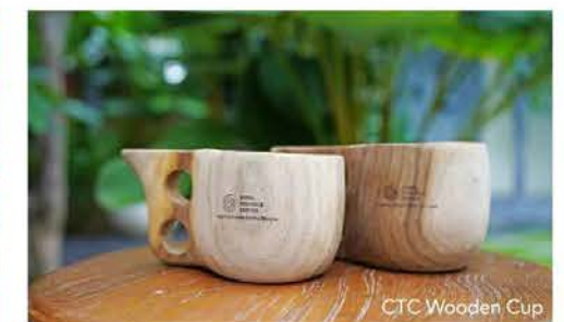
CTC Wooden Cup