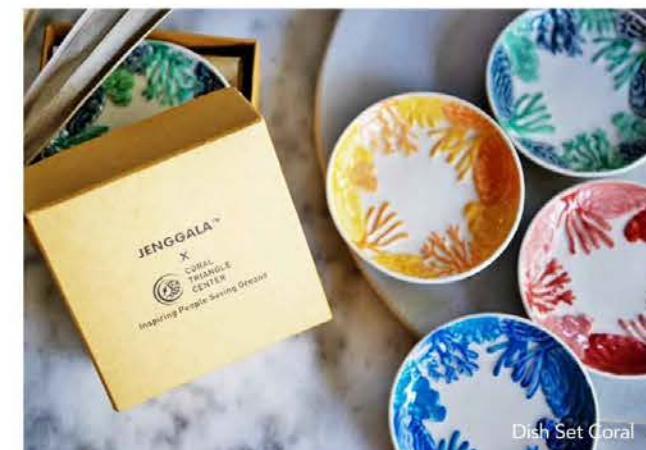
Dish Set Coral