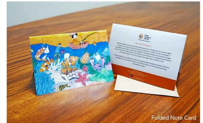
Folded Note Card