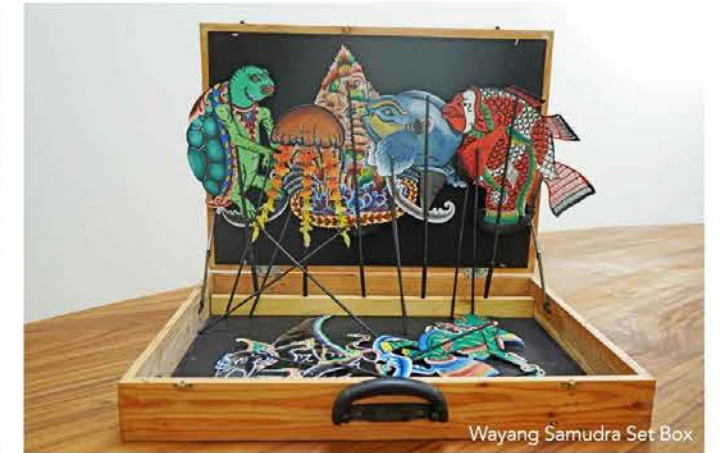
Wayang Samudra Set Box