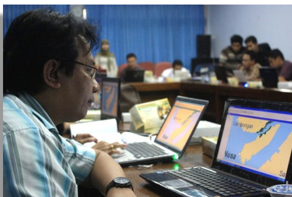
A UNBRAW participant practising GIS on a map of Nusa Penida