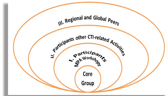
Figure: Illustration of incremental growth of MPA LN constituencies

An output of the CTI Learning Networks in general and the MPA Learning Network in particular is to build a platform for envisioned members of the learning network to share lessons learned and collect best practices. In July, 2011 the management group of the MPA RLN agreed on a strategy to differentiate the approach to MPA Constituencies with different levels of involvement. This platform can become a tool for the MPA Community of Practice in the Coral Triangle. Incremental growth of the members is suggested for the CTI MPA Learning Network (see figure). The first step is to form a Core group of MPA managers and resource persons with a group of individuals from the CT6 governments, local and international ngo's and universities. These individuals are invited on the basis of their commitment and ability to support MPA's in the CT-region. Their role would be to communicate the MPA Learning Network activities and engage members in their respective countries. The individuals are connected on-line in a WorkSpace dedicated to this MPA Learning Network. At the WorkSpace they can discuss on certain topics, find reference materials, and are updated about milestones related to the MPA Learning Network.