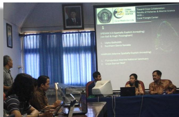
Talks about close cooperation between UNBRAW and CTC