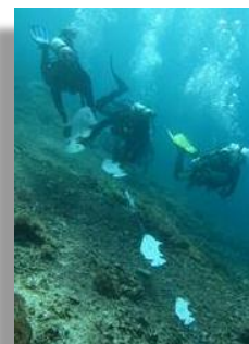
Instructions and simulations on Reef Health Monitoring - © Marthen Welly/CTC

The CTC team facilitated a survey for partners and students to conduct reef and fish monitoring in Nusa Penida. The activity was done back to back with a training on reef health monitoring at the CTC office in Sanur. CTC partners such as TNC-IMP and Reef Check Indonesia were co-facilitators during the training. Five students from IPB, UGM, UNDIP, Brawijaya and Hasanuddin University were trained in collection of reef and fish data in Nusa Penida from 8 – 13 September 2011. This reef and fish monitoring training was also covered by media partner Metro-TV – Expedition.